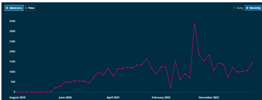
Figure 2 – OKS-PKP Abstracts access since first publication of APN;

Based on data from OJS/PKP, APN is gaining momentum and attracting interest from readers. The number of accesses to abstracts has been increasing progressively since 2019 (Figure 2) The literature lacks information regarding the growth of scientific journals.